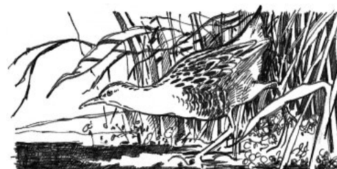
Birds such as the Water Rail will benefit from reedbed creation schemes.